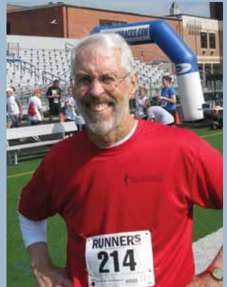
OAFP members wear "Family Docs in Motion" t-shirts during community events.