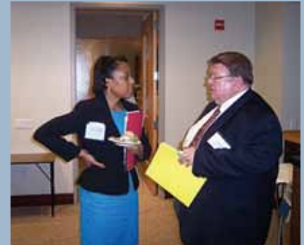
OAFP members meet and have valuable "face time" with state officials.

Conference program held on May 13 featured a panel discussion about the four above listed strategies for transforming Ohio's healthcare sector. Pleased that the strategies mirror key attributes of the PCMH, OAFP will work to help the Ohio Health Quality Improvement Council implement these reforms.