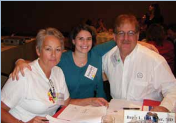
Three of the five participating CS2day practices take a break during the program.

• In June 2008, seven participating practices customized an office protocol regarding patient screening for colorectal cancer. In June 2009, an additional four practices joined customizing their practice protocol and launching their own practice initiatives. This program, made possible with funding from Centers of Disease Control and Prevention (CDC) and Ohio Division of American Cancer Society, provides not only CME for physicians but also maintenance of certification data for the American Board of Family Medicine's Part IV Module for Comprehensive Care.