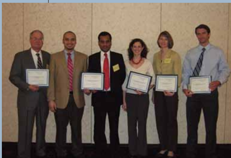
Winners from the Ohio Family Medicine Symposium gather together during the Mega Spring Event.

The Ohio Family Medicine Symposium, Resident Program Faculty Development Day, Student Retreat and