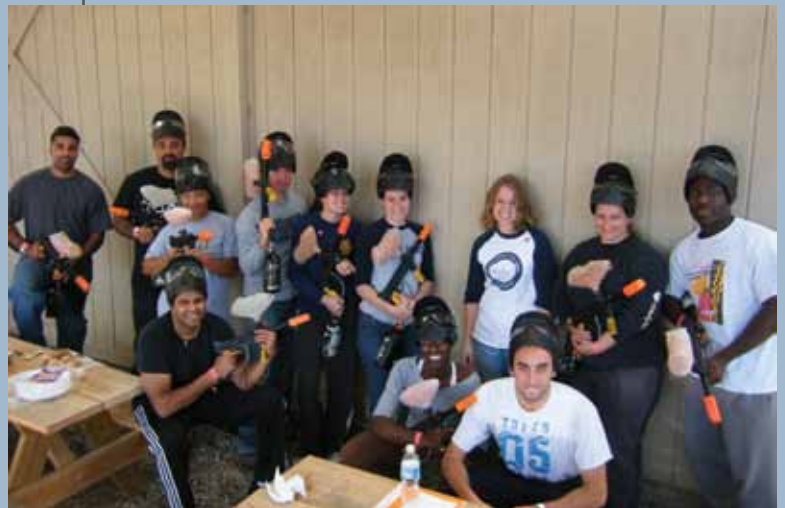
OAFP student and resident members participate in paint ball at "Splatter Park."

OAFP continues to work closely with students and FMIGs—offering students many opportunities for involvement. We produce an annual retreat program for students, conduct an FMIG grant program, plan a FMIG advisors' summit, provide scholarships to national meetings, host a student dinner with Executive Committee and an annual fall kick-off event for the Student Affairs Committee—last year, paint ball at "Splatter Park;" this year, high ropes at Camp Mary Orten. Ohio Academy of Family Physicians Foundation's (OAFP/F) mission also focuses on "filling the pipeline" and in turn the Foundation pays AAFP membership dues for medical students (in 2008, for 271 students and so far in 2009, for 88 students) and